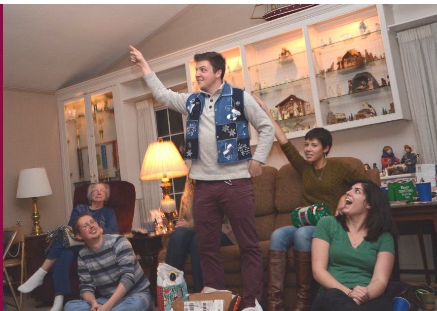
The Holiday Vest made another appearance at the SAACS Christmas party